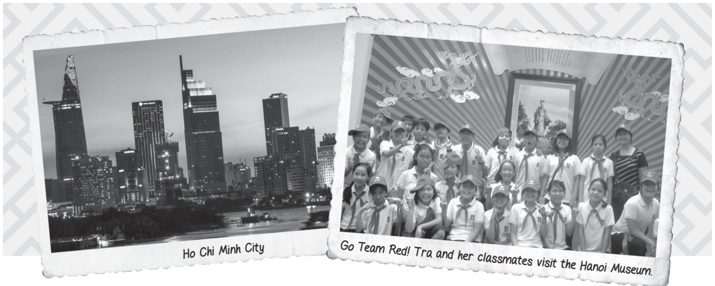
Ho Chi Minh City