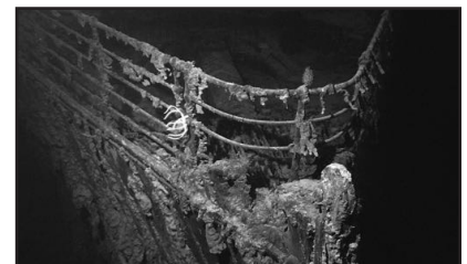
View of the bow on the Titanic wreck