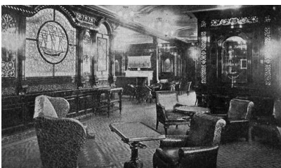
First-class smoking room

5 During all of this confusion, the ship gradually filled with water. There were many people still on board when the Titanic finally sank into the ocean. Of the more than 2,000 passengers and crew who left England, only 705 survived.